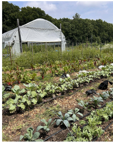
View near the high tunnel with kale in the foreground