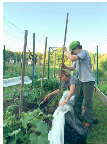
Many students brought their children with them!