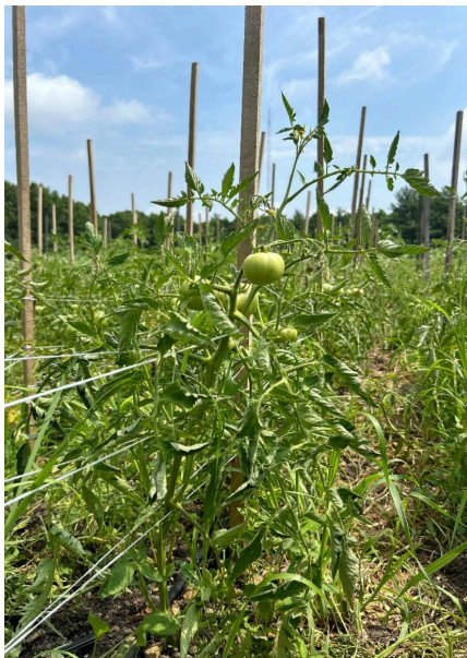
Tomatoes growing slowly - but in time for a late July harvest