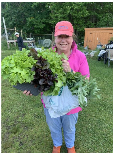
One participant with a hearty bounty